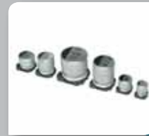
SMD ALUMINUM ELECTROLYTIC CAPACITOR